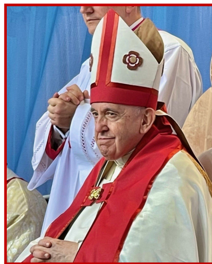
Prayer for Pope Francis

Monday - Friday, 10 AM - 12 PM and 1 - 4:30 PM. Phone: (604) 682 6774 ext. 0