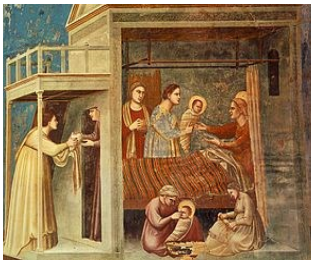
The Birth of the Blessed Virgin Mary by Giotto, in the Scrovegni Chapel Padua, Italy (circa 1305

pray for our government and business leaders and ourselves to work together to make a healthy work that "through her birth, the nature inherited from environment in Canada. We should keep in mind those who have been injured or killed at work, and those who are unemployed and those who are underemployed. May God help us all to work for His glory and the good of all people.