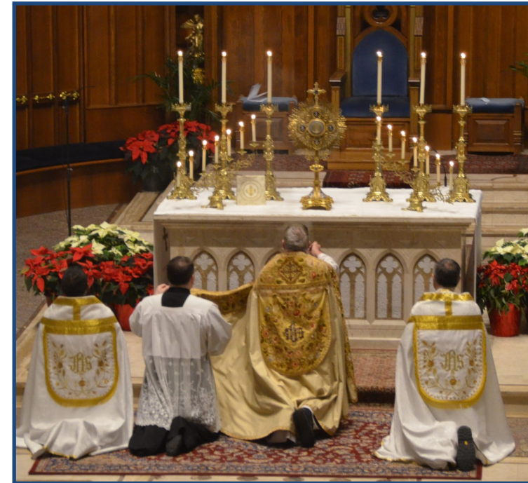
June 2, 2024 | CORPUS CHRISTI

646 RICHARDS STREET, VANCOUVER, BRITISH COLUMBIA, V6B 3A3